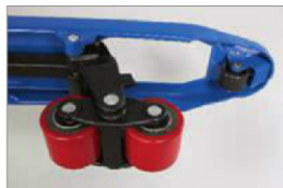
Tandem load rollers ease pallet entry and exit.