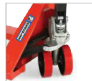
Specially designed cast steel pump.

For complete specifications, see chart at bottom of page.