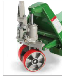
5-year full replacement pump warranty

For complete specifications, see chart at bottom of page.