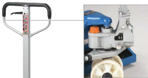
Quick Lift cast steel pump raises 0-330 lb. loads off the floor with only 2 strokes